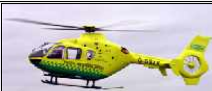
The new Essex Air ambulance - an EC135 Eurocopter - saving lives across the County

SHOULD ANYBODY FEEL ABLE TO HELP DEVELOP THIS APPROACH, WOULD THEY PLEASE CONTACT THE CHAIRMAN - NORMAN STANLEY AT 813073.