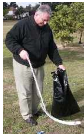
A volunteer litter-picker

Anybody can join in, just be at the village hall at 9.30 am on the first Saturday in every month and all the necessary sacks, tabards, gloves, litter pickers will be provided.